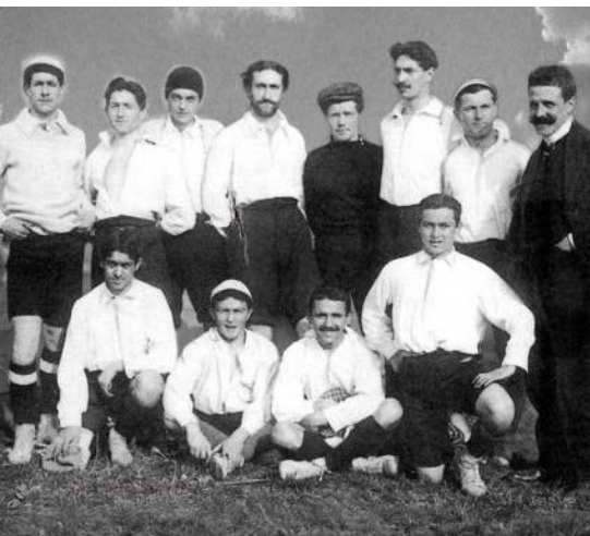
PRO VERCELLI 1908