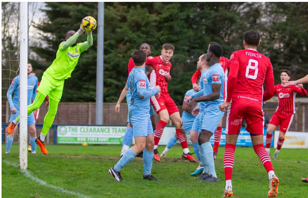
IMAGE FROM OUR 2-2 DRAW AGAINST BRENTWOOD TOWN IN JANUARY