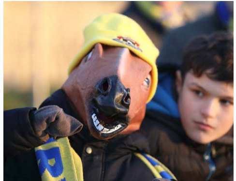
EQUESTRIAN